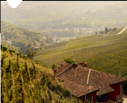
ABOVE MARTINI ASTI VINEYARD, IN ITALY

BACARDI LIMITED CORPORATE RESPONSIBILITY REPORT 2020