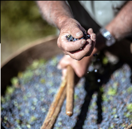
ABOVE BOTANICALS USED IN THE PRODUCTION OF BOMBAY SAPPHIRE

BACARDI LIMITED CORPORATE RESPONSIBILITY REPORT 2020