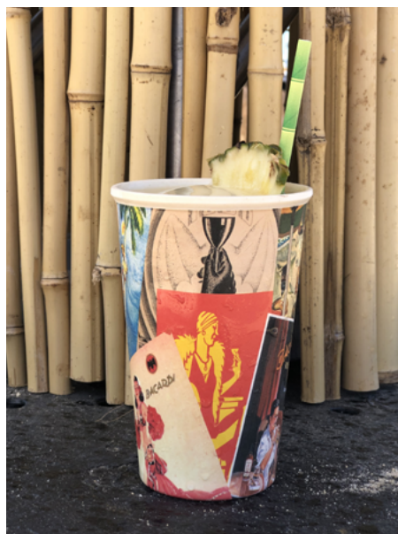
ABOVE THE FUTURE DOESN'T SUCK DIGITAL CAMPAIGN

BACARDI LIMITED CORPORATE RESPONSIBILITY REPORT 2020