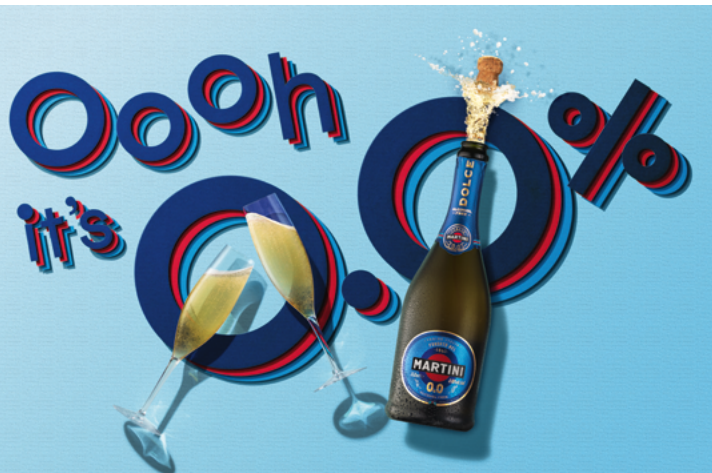
ABOVE MARTINI LAUNCHES ZERO ALCOHOL SPARKLING WINE