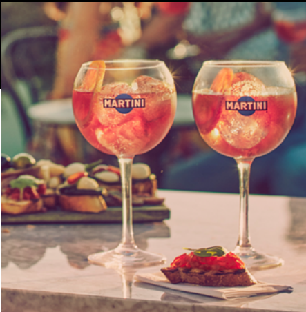
ABOVE MARTINI NON-ALCOHOLIC VIBRANTE

AS A GLOBAL SPIRITS PRODUCER, WE HAVE A RESPONSIBILITY TO HELP REDUCE THE HARMFUL USE OF ALCOHOL.